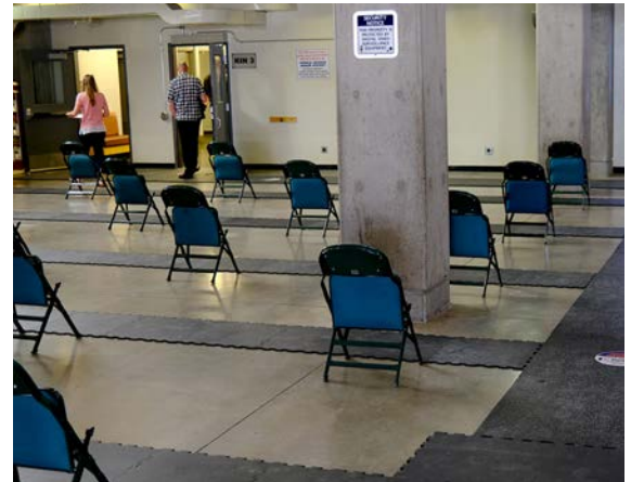
Seats in the Kin Atrium are spaced two metres apart and provide an area where participants can prepare to proceed to the ice.