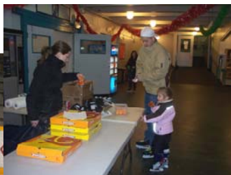
More photos of the Skate with Santa on PGRA's website.